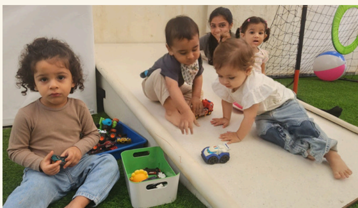
Our Just Toddler class having some outdoor fun