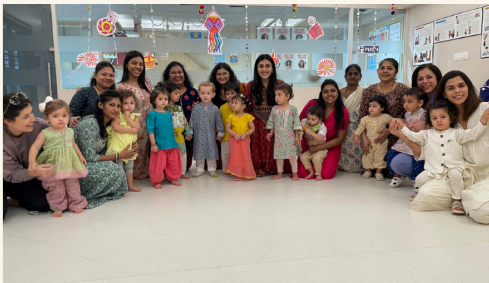
Diwali fun with Preschool & Just Toddlers