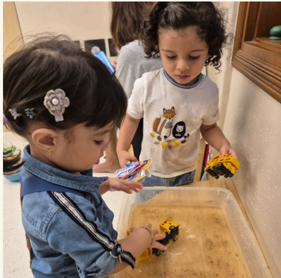
uh-oh time to clean the dirty trucks!