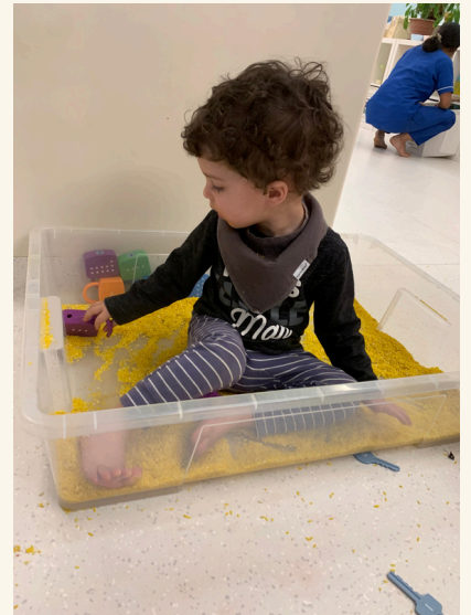
Lock & Keys!