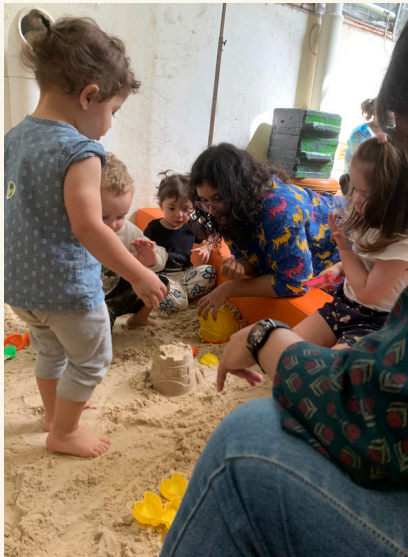
Preschool is here, making Sandcastles!